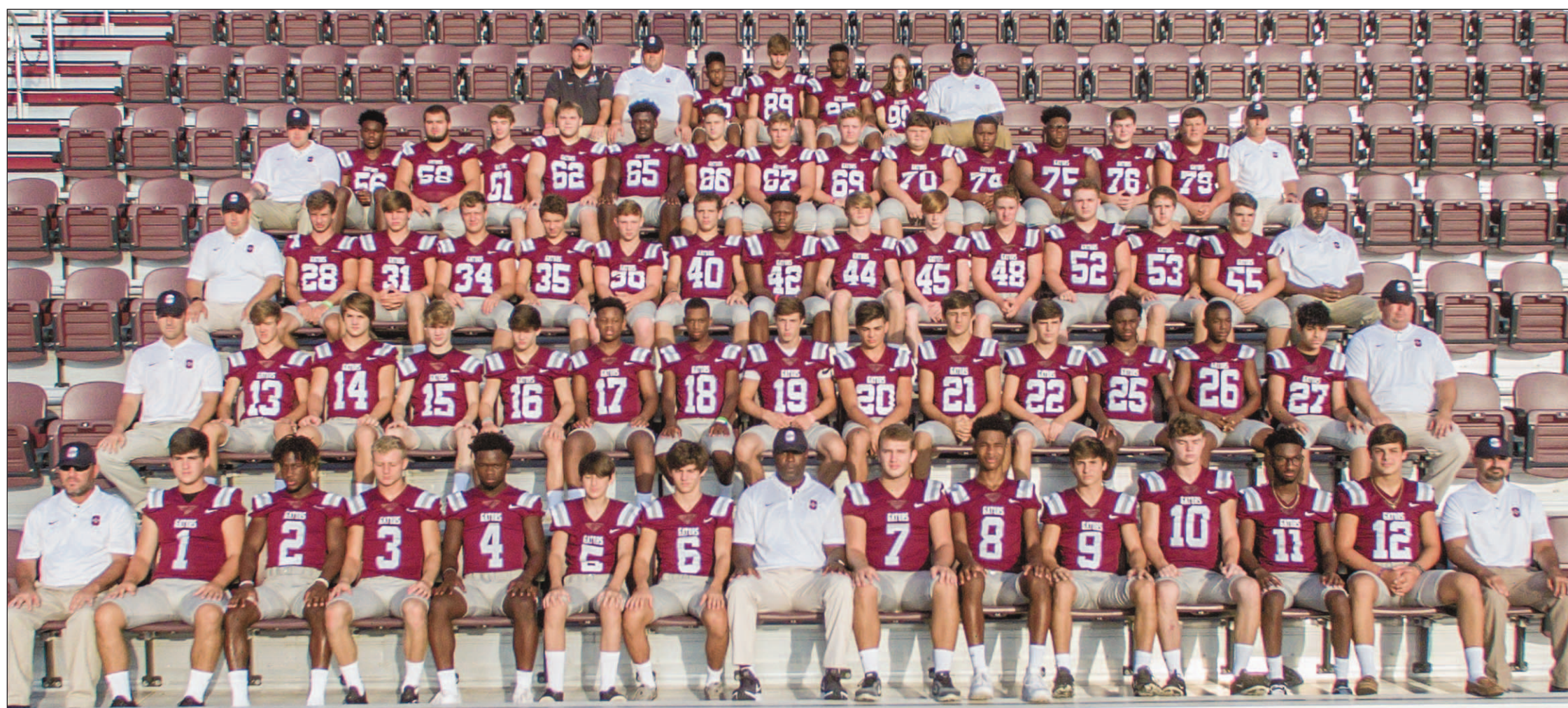
The 2018 Satsuma High School Gators