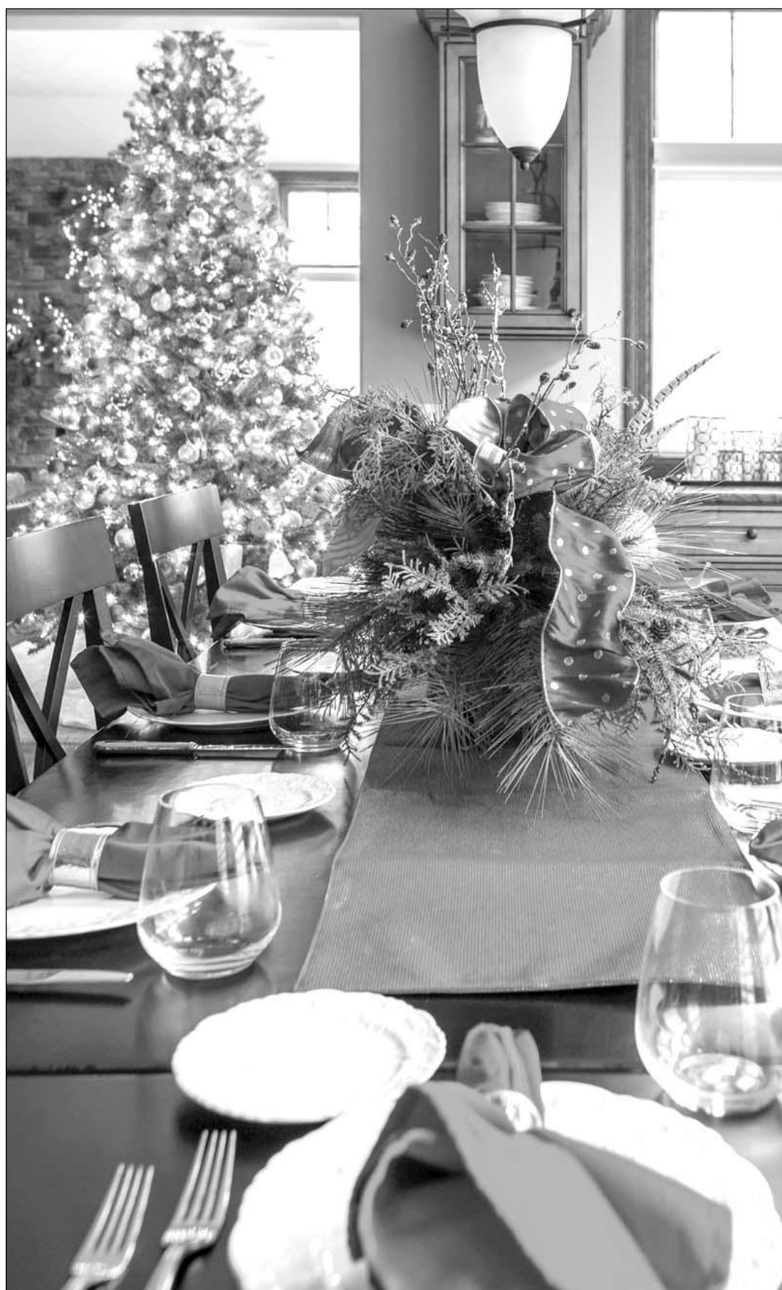
Thanksgiving is just around the corner, and soon your home will be filled with family and friends. Whether it's your first time planning the holiday meal or you're a seasoned host, it helps to prepare.

The City of Citronelle wishes everyone a safe and happy holiday season!