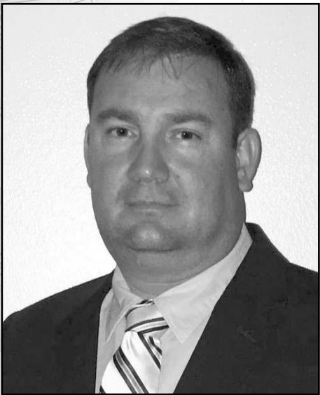
Mayor Jason Stringer

The City of Citronelle wishes everyone a safe and happy holiday season!