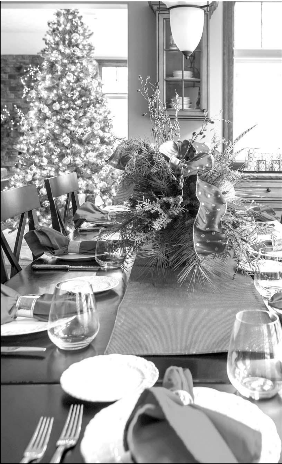
Thanksgiving is just around the corner, and soon your home will be filled with family and friends. Whether it's your first time planning the holiday meal or you're a seasoned host, it helps to prepare.

The City of Citronelle wishes everyone a safe and happy holiday season!