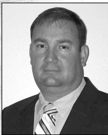
Mayor Jason Stringer

The City of Citronelle wishes everyone a safe and happy holiday season!