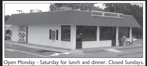
Open Monday - Saturday for lunch and dinner. Closed Sundays.