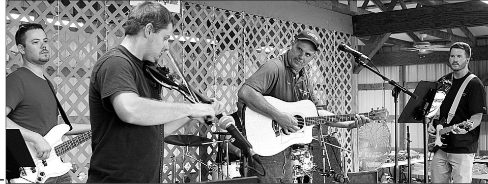
The Tywhoppity Bottom Boys

Restore and maintain your body to its optimum health.