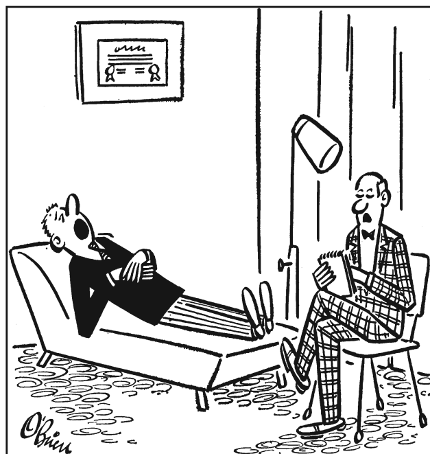
"So, how long have you had trouble sleeping?"