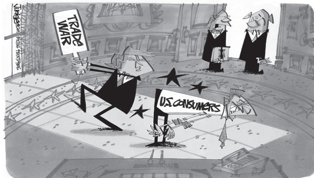
"IT'S HOW WE PUNISH THE CHINESE."

Games begin January 7, 2019. Volunteer coaches are needed. League sponsorships are also available. Gold $500 and Silver $250. For more information on the Youth Basketball Winter League, call 561-642-2090, 642-2092 or visit www.greenacresfl.gov .