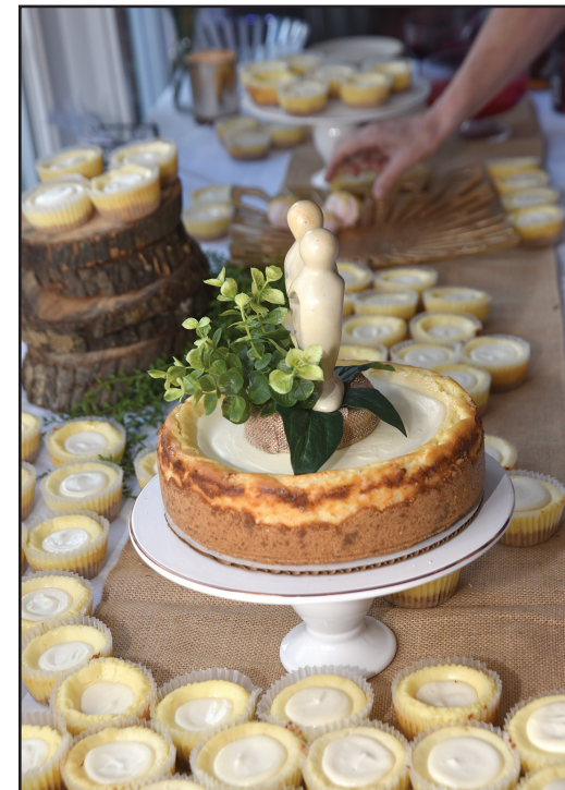
Instead of a tradition cake the couple opted for cakeballs from the Mad Batter and mini-cheesecakes with assorted toppings.