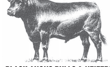
BLACK ANGUS BULLS & HEIFERS