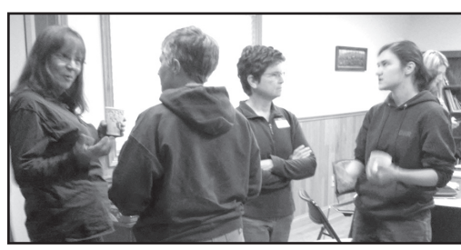
Women 4 the Land Forestry Learning Circle