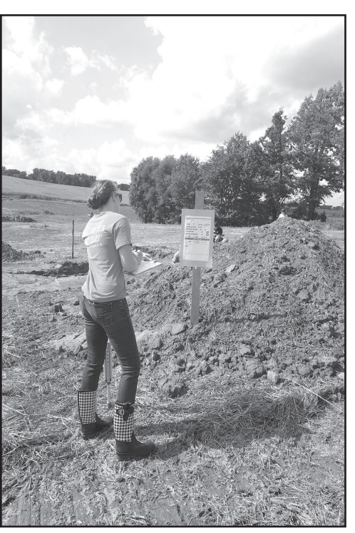
2017 Soil Judging Contest