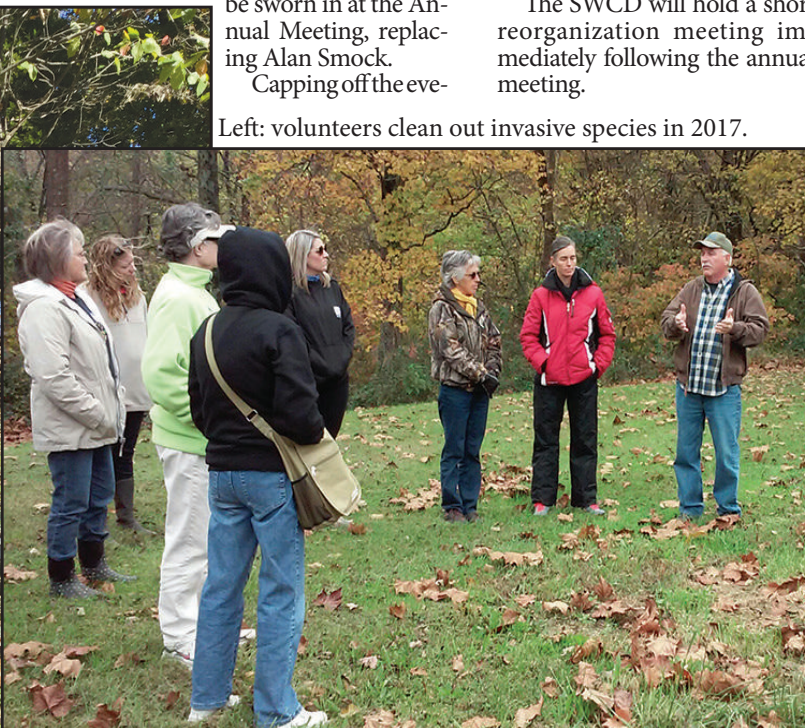
Left: volunteers clean out invasive species in 2017.