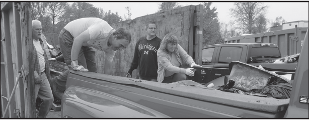
Unloading from 2017 Creek Sweep