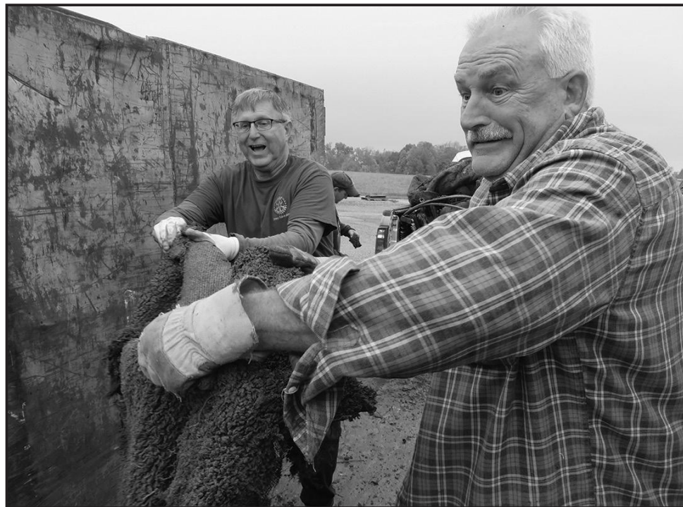
Heavy lifting was required in the 2017 clean-up.