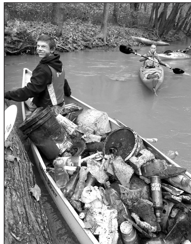
Kayakers assist in picking up huge quantities of trash on Patoka River during 2017 Creek Sweep.

The VUJC Land Stewardship Initiative is a five year old ongoing project of the SWCD. This partnership with Vincennes University,