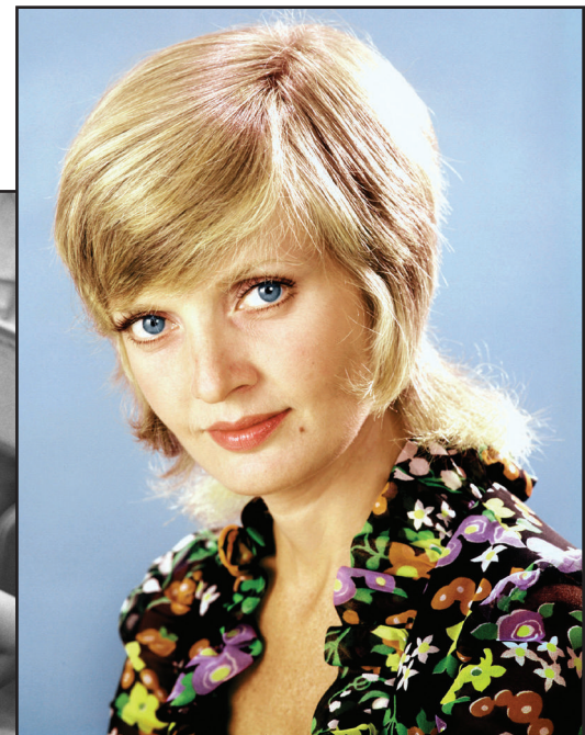
Left: Florence Henderson started her career on Broadway starring in the musical Wish You Were Here in 1952.