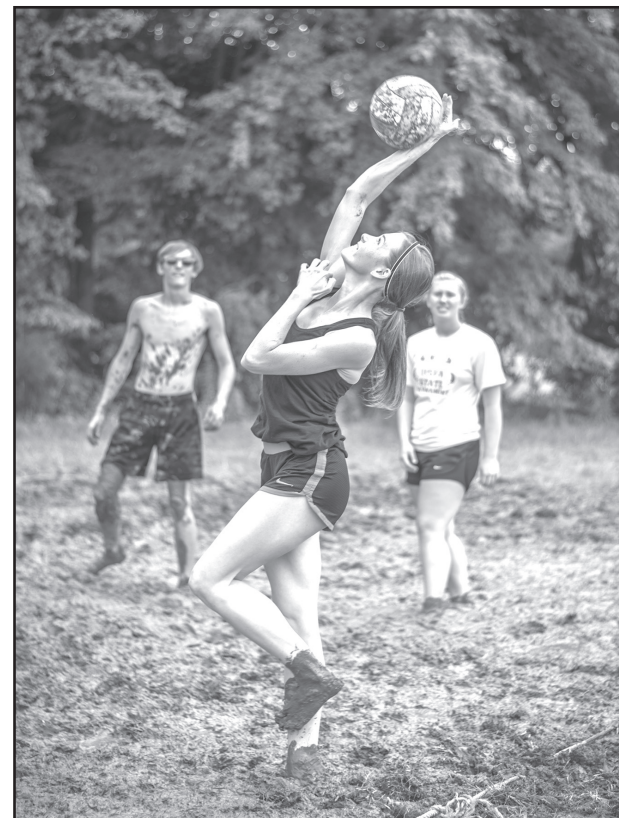
Mud Volleyball participants at play.