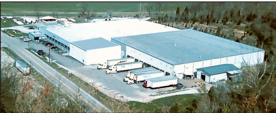
Winkler operates out of two warehouses encompassing 160,000 sq. ft., amassing annual sales in excess of $150 million.