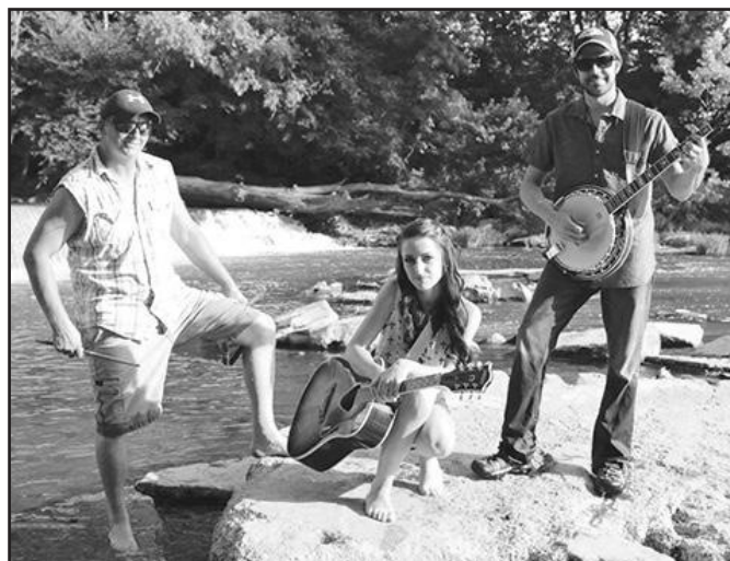
The Strings of Indian Creek