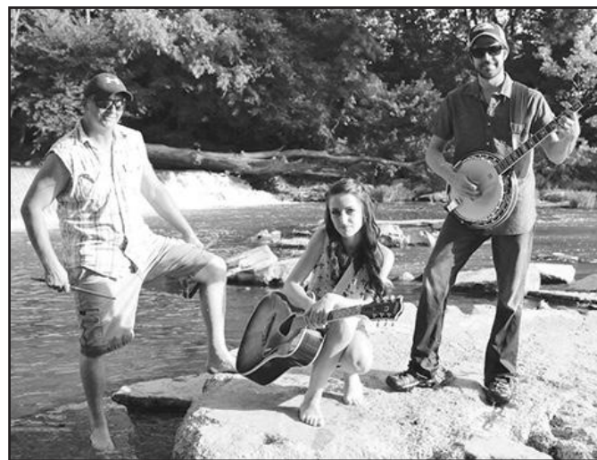
The Strings of Indian Creek