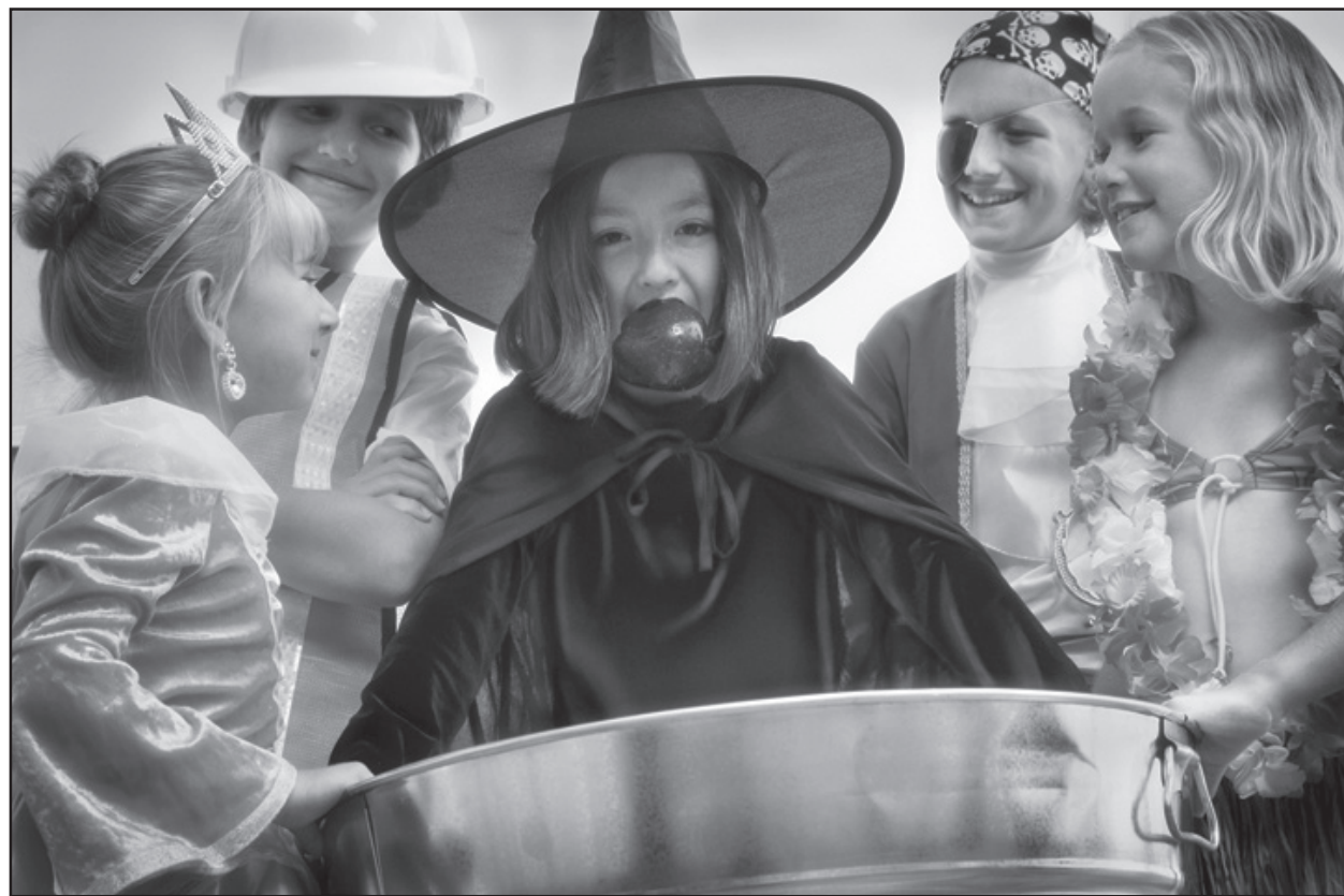
Apple bobbing once was used as a way to weed out potential marriage suitors. Since then, it has become a fun Halloween party game primarily for children.

Some might be surprised to learn that bobbing for apples is rooted in ancient customs that may have had something to do with marriage. While few would pair matrimony with bobbing for apples today, this fun tradition can still be enjoyed by Halloween revelers.