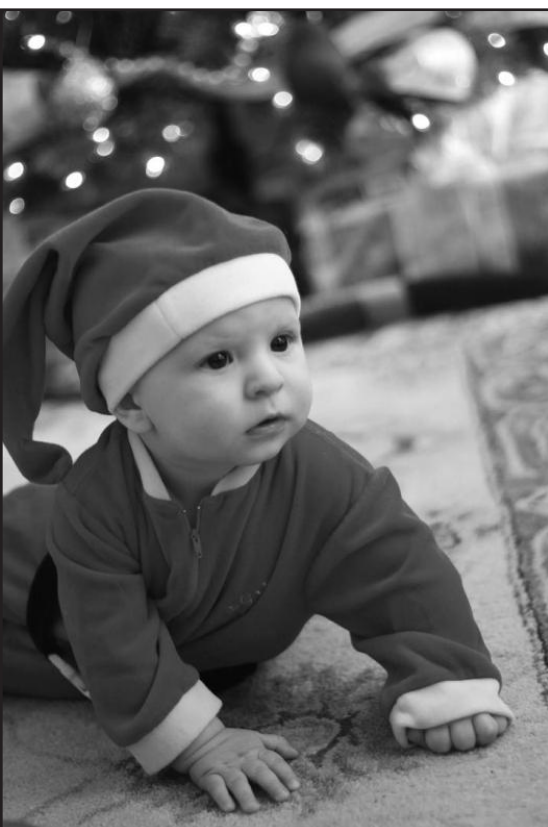
Thoughtful gifts can make this first holiday season one of joy for new children in the family.

A baby's life is filled with milestones. First smiles, first steps and first words are just a few of the moments parents will treasure.