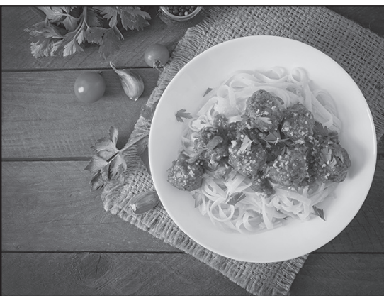
With a few easy tweaks, meals can be made much more healthy.

Research from the National Institutes of Health suggests American adults between the ages of 18 and 49 gain an average of one to two pounds every year. Grazing and overeating tends to increase when the weather cools