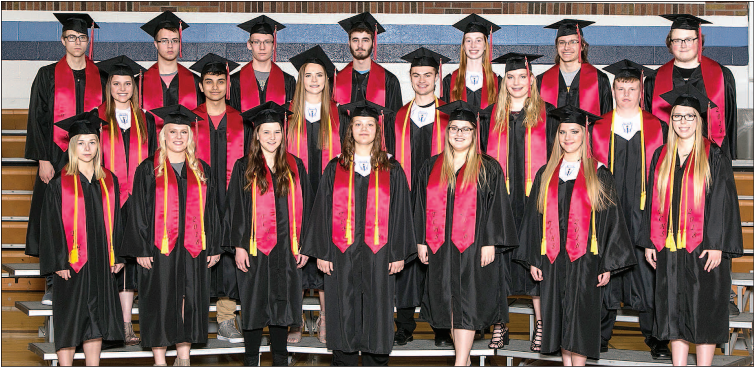
Pictured at left

Tri-County High School Graduates in their caps and gowns