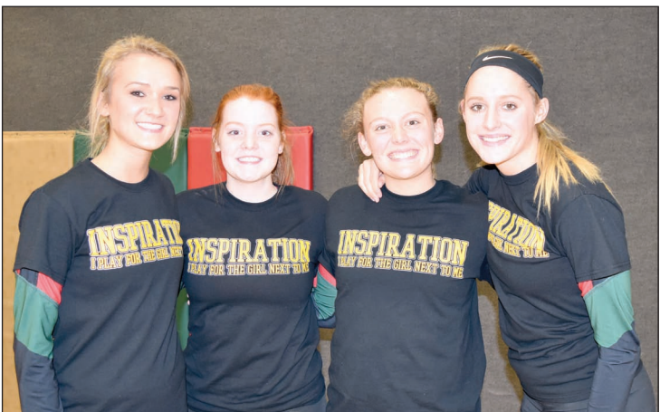
SENIOR VOLLEYBALL PLAYERS