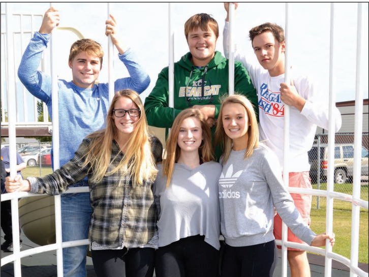
KITTSON CENTRAL HOMECOMING CANDIDATES