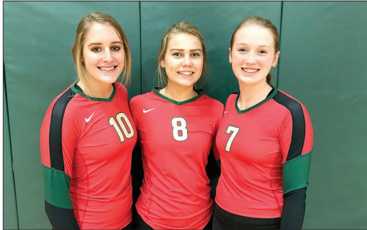
VOLLEYBALL ALL CONFERENCE