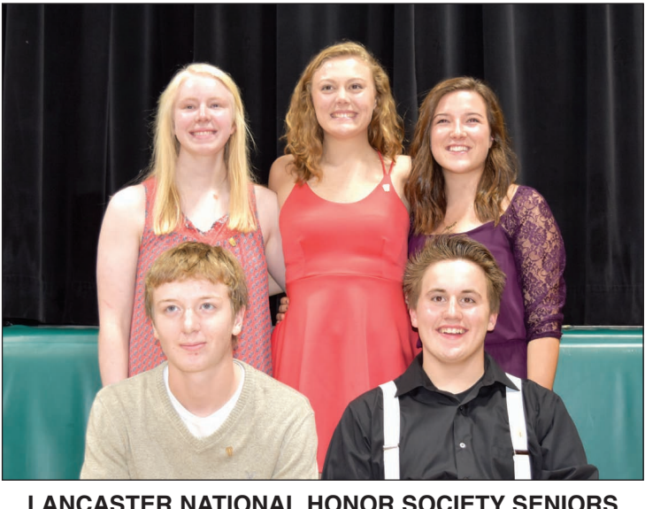
LANCASTER NATIONAL HONOR SOCIETY SENIORS