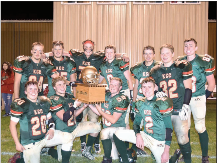
SENIORS WITH THE GOLD HELMET TROPHY