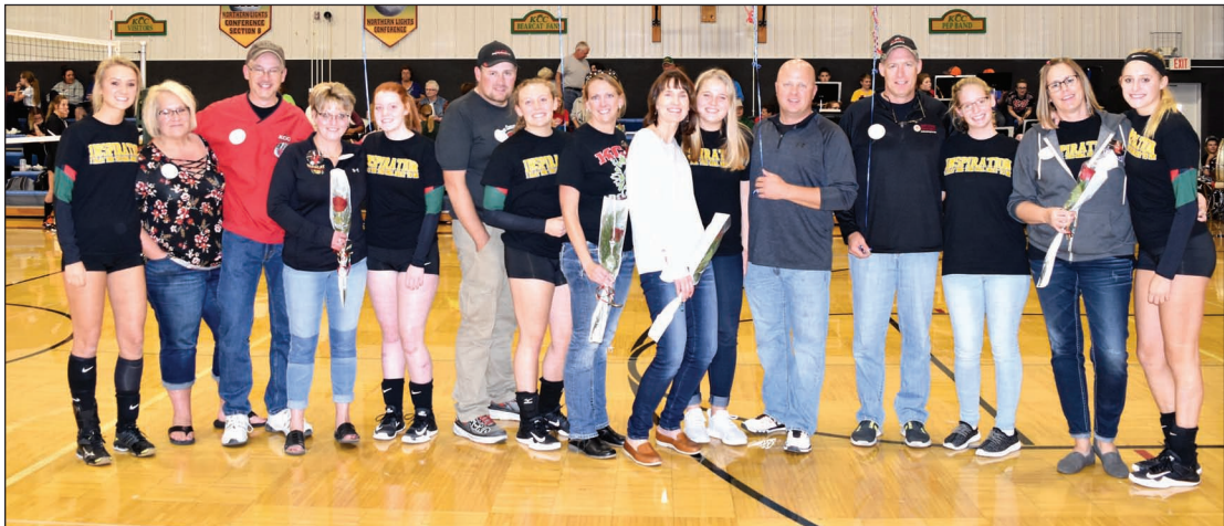
KCC BEARCATS VOLLEYBALL PARENTS NIGHT - SENIORS