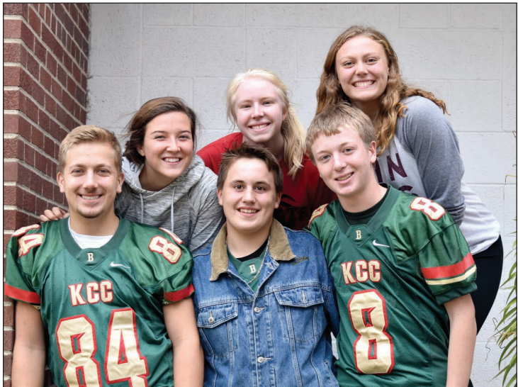
LANCASTER HOMECOMING CANDIDATES