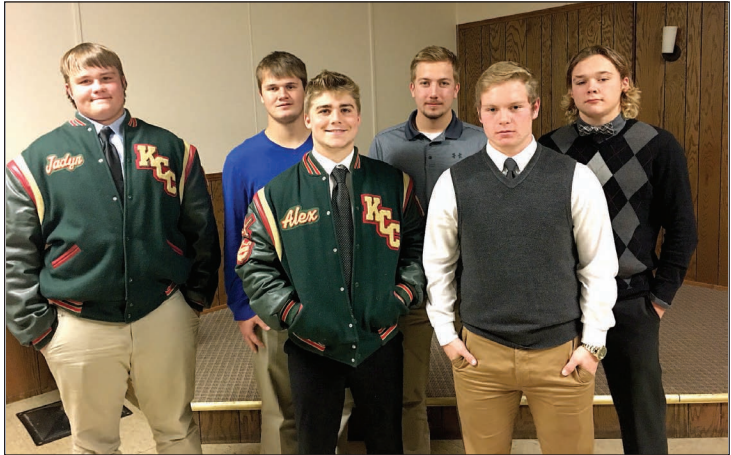
FOOTBALL ALL CONFERENCE