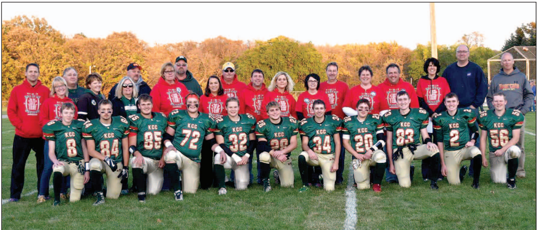
KCC BEARCATS FOOTBALL PARENTS NIGHT - SENIORS