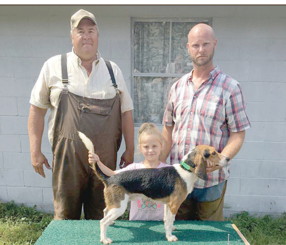
1st Open Class was Cut Throat's JR owned by C&M Kennels

The Russell County Beagle Club held a ARHA Little Pack Hunt on September 1, 2018. The winners were: