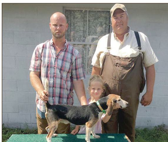
1st Champion Class was Passmore's Big Chopper owned by C&M Kennels