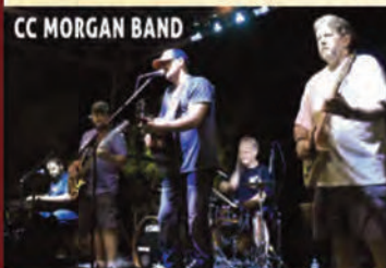
CC MORGAN BAND

ROAD RACE AT 8 AM PARADE AT 10 AM FREE CONCERT Starting AT 6:30 PM