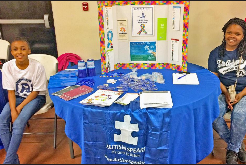
Holmes County members of Rho Nu Zeta Chapter’s youth auxiliary group presented the Z-HOPE Project: Living with Autism on Saturday, April 28 at (CDI) 2018 Parent Conference in Lexington at the Multi-Purpose Complex Building. April is National Autism Awareness Month.