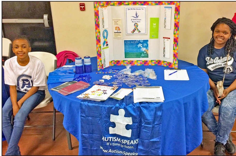
Holmes County members of Rho Nu Zeta Chapter's youth auxiliary group presented the Z-HOPE Project: Living with Autism on Saturday, April 28 at (CDI) 2018 Parent Conference in Lexington at the Multi-Purpose Complex Building. April is National Autism Awareness Month.