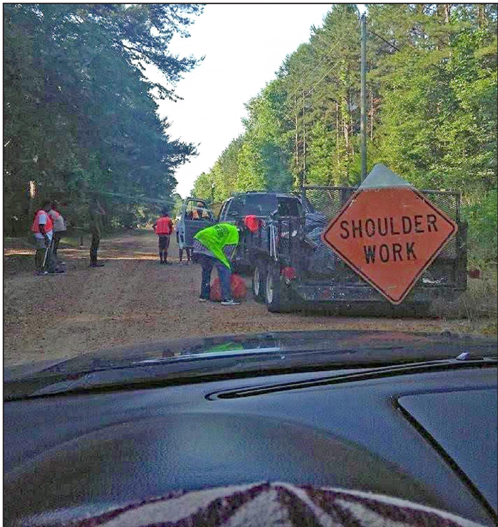
Trash clean up efforts were spearheaded by local resident Algenia Adams on roads south of the Ebenezer Big Store with help from other locals and the Holmes County Sheriff's Department. (Photos submitted)