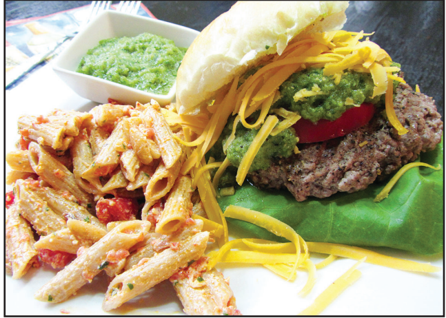
A Green Chili Cheeseburger with Whole Wheat Pasta Salad is a nice twist on the classic All-American Cheeseburger.