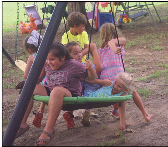
Oregon Memorial Church off of MS Highway 12 near Lexington held Vacation Bible School for area youth the week of June 17. The fun included crafts, swimming and lots of food. Pictured above, children pile on the jungle gym swing one day during play time. See more photos from the event in this week's edition on page 6.