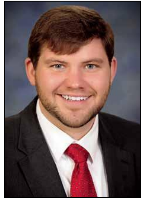
Special to The Clinton Courier