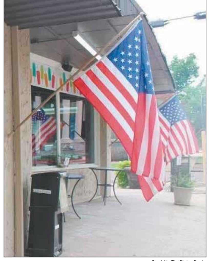
Clinton's Civitan chapter offers American flag displays for local businesses.

Ongoing projects for Civitan include the maintenance of a flowerbed in conjunction with the City of Clinton's beautification efforts; an annual contribution to the 4C's; an annual clergy or City departmental appreciation luncheon; and scholarships to two Clinton High School seniors who plan to attend Mississippi College or Hinds Community College.