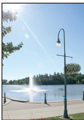
Cravath Lake in downtown Whitewater.

Aug. 4-Brat Sale/Maxwell Street Days: Spend the day (9 a.m. to 4 p.m.) finding great shopping