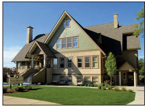
Front view of the elegant Fort Atkinson Club.

The Fort Atkinson Club offers a beautiful setting