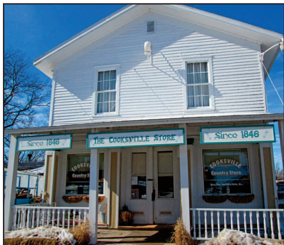
The Cooksville Store was founded in 1846.