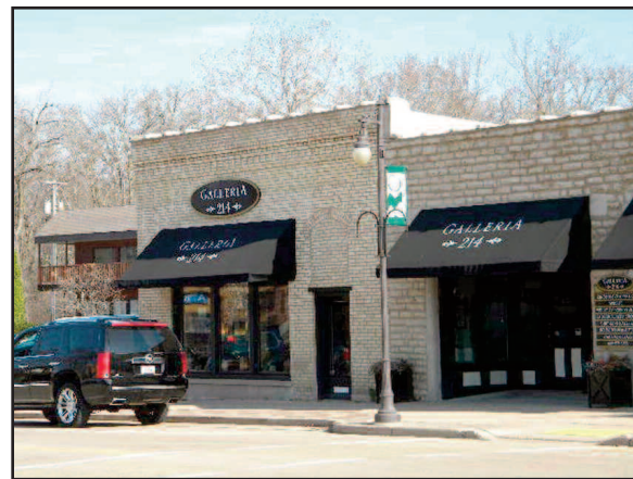
Front view of Galleria 214 on Main Street in Cambridge.