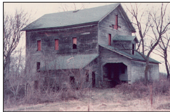
Beckman Mill, before and after an elaborate restoration project completed by the Friends of Beckman Mill group.