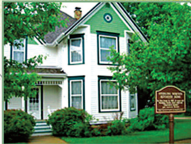
The North home has been restored and refurbished with period furniture.