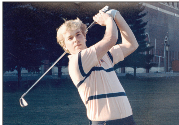
Steve Stricker honed his golf skills at the University of Illinois before turning pro.

The 51-year-old Stricker joined the PGA Champions Tour in 2017 and finished second in his first event, which was the Tucson Conquistadors Classic. He would put himself back in the winner's circle at the Colouard Classic on March 4 and the Rapiscan Systems Classic on March 25 of 2018.