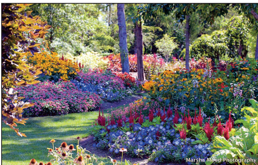
Expect stunning colors at Rotary Botanical Gardens in Janesville.

Rotary Botanical Gardens also hosts an extensive collection of perennials, trees and shrubs and has become known for spectacular seasonal displays that blend annuals and perennials in exuberant beds and containers.