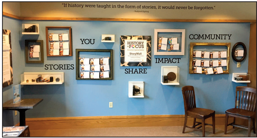
A "Story Wall" inside the museum center showcases dozens of stories from interesting Rock County residents.

•Sept. 4: Alternative Facts and American History. From the historical society's description of the program: "Did George Washington really chop down a cherry tree? Did the pilgrims eat turkey at Thanksgiving? Many stories in American history aren't always the real story. Learn the hard