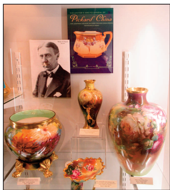
RCHS's exquisite "Crafting Excellence: The History of Pauline Pottery & Pickard China" exhibit has been refreshed, with new pieces being added this spring.

For more on the society's programs, events, exhibits, facilities and offerings, visit www.rchs.us or call RCHS at 608-756-4509.