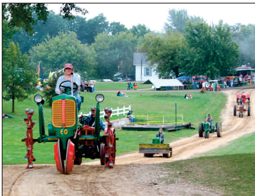
A procession of tractors and other antique farm equipment form the Threshere's "Parade of Power" at last year's festival.

For more pool details call 608-884-3232.