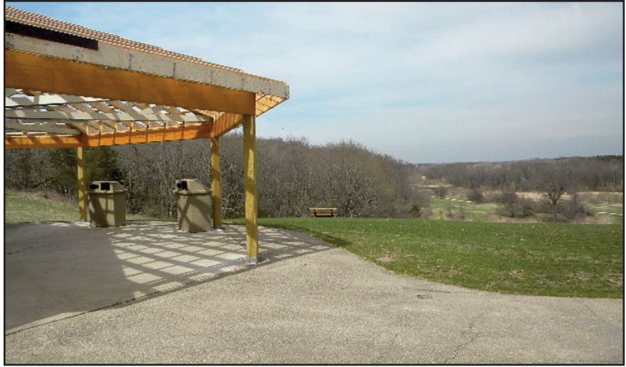
Shelter #3 in Cam-Rock Park is undergoing a rebuild.