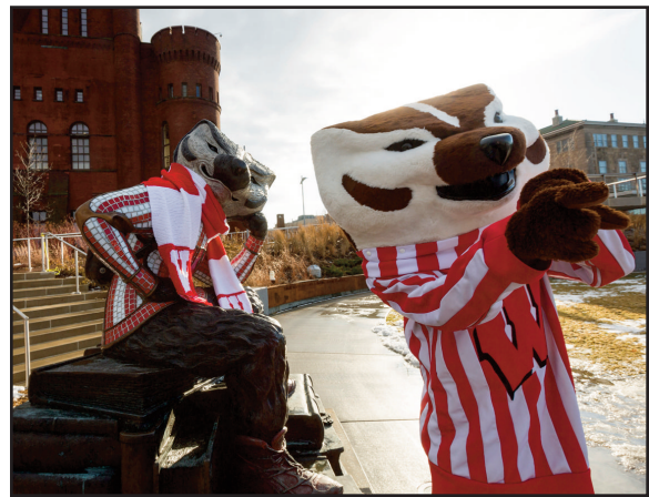
Bucky Badger stops by his own "Well Read Bucky" statue at Alumni Park.

Whatever you do, you'll have a blast. Enjoy Madison: a capital idea and a Wisconsin gem!