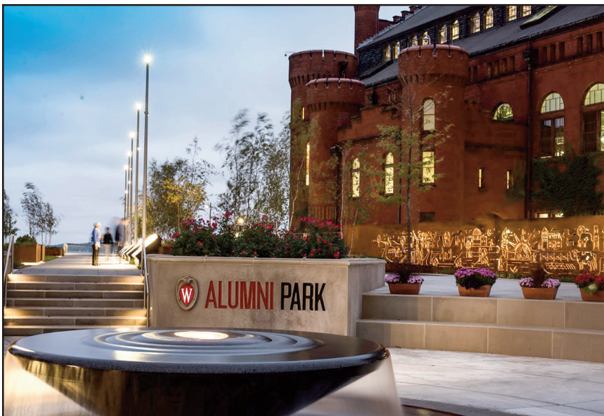
Beautiful Alumni Park is located at 724 Langdon St. in Madison.