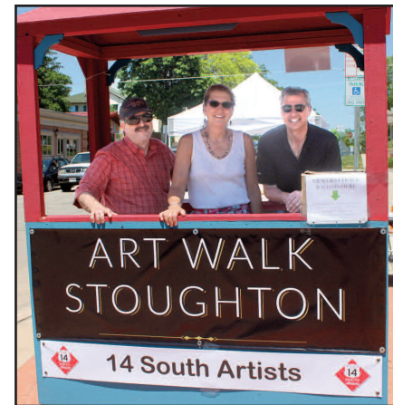
Volunteers staff a booth during the Art Walk in Stoughton last June, when streets were lined with people looking for treasures. This year's Art Walk will be held July 21.