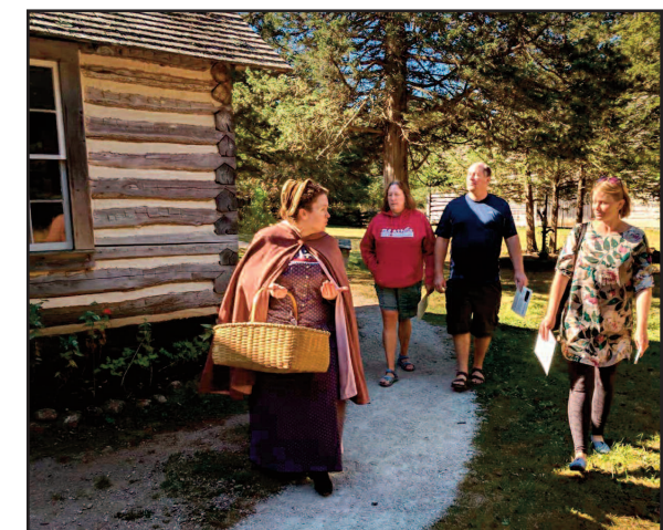
The "Take the Wisconsin Tour" at Old World Wisconsin.

The Wisconsin Journey is a new 90-minute, guided experience as you travel the path of immigrant families coming to Wisconsin and becoming American. A costumed host will lead small-groups to three historic structures where you will put yourselves in the shoes of early immigrants. You will explore choices, hold history in your