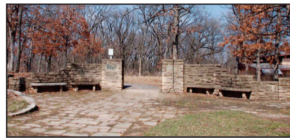
Dane County's Frank W. Hoyt Park is new to Wisconsin's Register of Historic Places.

5:30 p.m. to 8:30 p.m. on June 16, July 21 and Aug. 11 Enjoy an early evening cruising Geneva Lake while learning about the history of the beer barons that vacationed and lived along its shores. No presentation about beer would be complete without a tasting so join us in raising a pint together. This program will highlight the evolution of the brewing industry in Milwaukee and Chicago with a local flavor. Beer tastings, snacks and a souvenir beer mug are included in the ticket price.