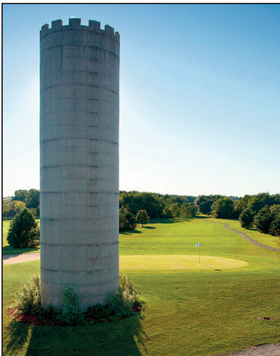
Coachman's offers 27 holes of scenic, championship golf.

preciation, the resort hosts many local gatherings and charitable events. The second generation, family-owned business is open seasonally, generally from March to December each year. Located right off Interstate 39/90 (Exit 156) between Edgerton and Stoughton at Highway 51, it's an easy drive from wherever you are.