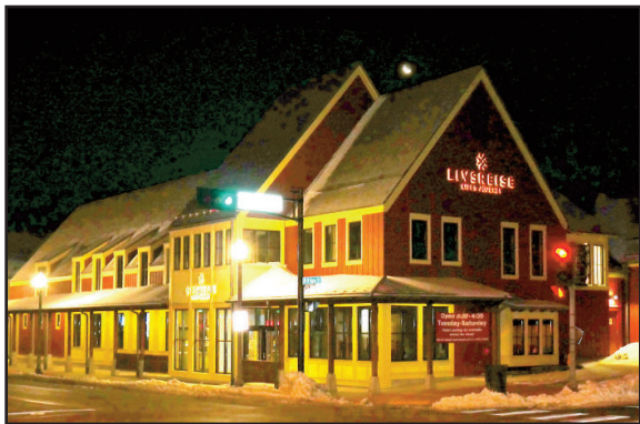
Exterior of Livsreise.