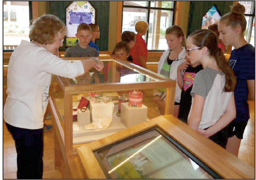
Above: A Livsreise volunteer assists a group of student visitors. Below: Inside the center.

For further information call 608-873-7567, visit Livsreise's website ( www.livsreise.org ) or find the center on Facebook.