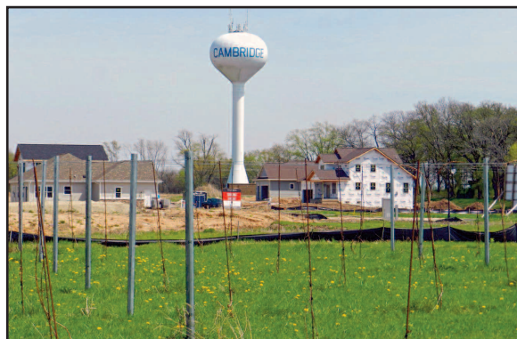
Grape vines insinuate the rising residential development next to The Cambridge Winery.

Like the vino-development itself, the image is larger than life.