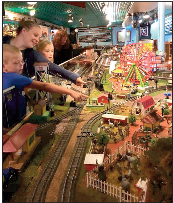
Inside and outside the Toy Train Barn.

Located 7.5 miles west of Monroe at W9141 Hwy. 81, the toy train barn is open daily from 10 a.m. to 5 p.m. Visit www.whrc-wi.org/trainbarn/ or call 608-966-1464 for more information.