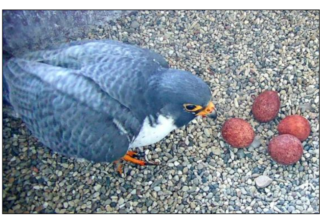
Peregrine falcon in Weston nestbox April 5.