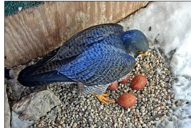
Peregrine falcon in Pulliam nestbox April 5

Since 1996, more than 90 peregrine falcons have hatched inside the WPS nest boxes, helping increase the population of a species that remains endangered in Wisconsin.