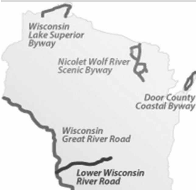
The Nicolet-Wolf River Scenic Byway runs along State Highway 55 as the primary route, and segments of State Highways 32, 52 and 70, to form a double loop or figure "8".