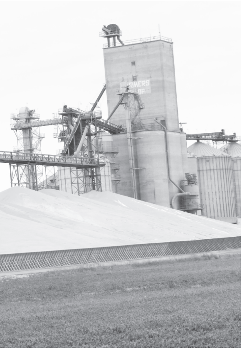
It was a close race with winter that was eventually won by Kava Construction and Agassiz Valley Grain as corn began to flow across the transfer equipment and into the bunker in early November. The construction work was completed as farmers struggled to work through the mud to retrieve last fall’s corn crop. Eventually the ground froze up with no snow cover and all of the corn came off in a rush.