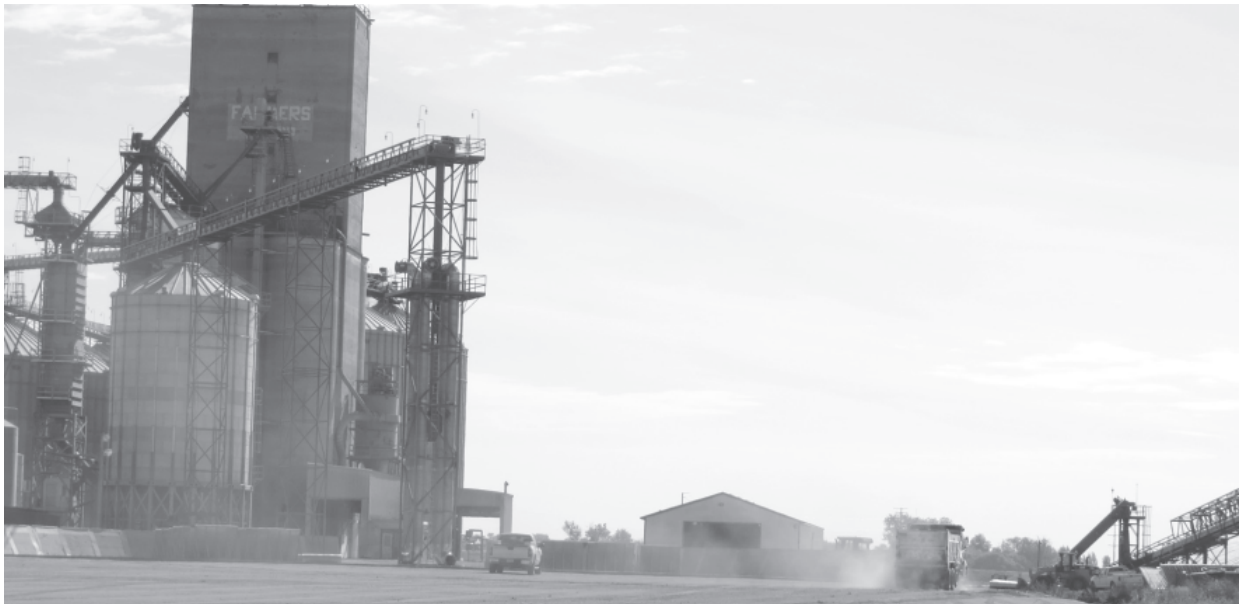
As summer began to turn into fall, the outline of the new 1.6 million bushel bunker was beginning to take shape at Agassiz Valley Grain north of Barnesville. Fitzgerald Construction of Sabin was putting the final touches on the foundation of the huge 490 by 190-foot slab that would provide the foundation for the new bunker.