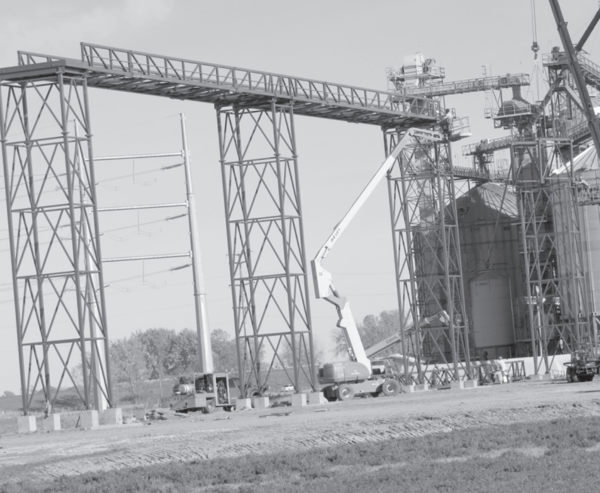
Once the overhead steel superstructure work began to move to the west it went rather quickly. New towers were connected to overhead superstructure on a daily basis.

The new bunker holding about 1.6 million bushels of wet corn has had cold air blowing through it since harvest. That crop will be moved through the grain dryer, transferred to vertical bins and then shipped before spring weather has an opportunity to spoil the corn.