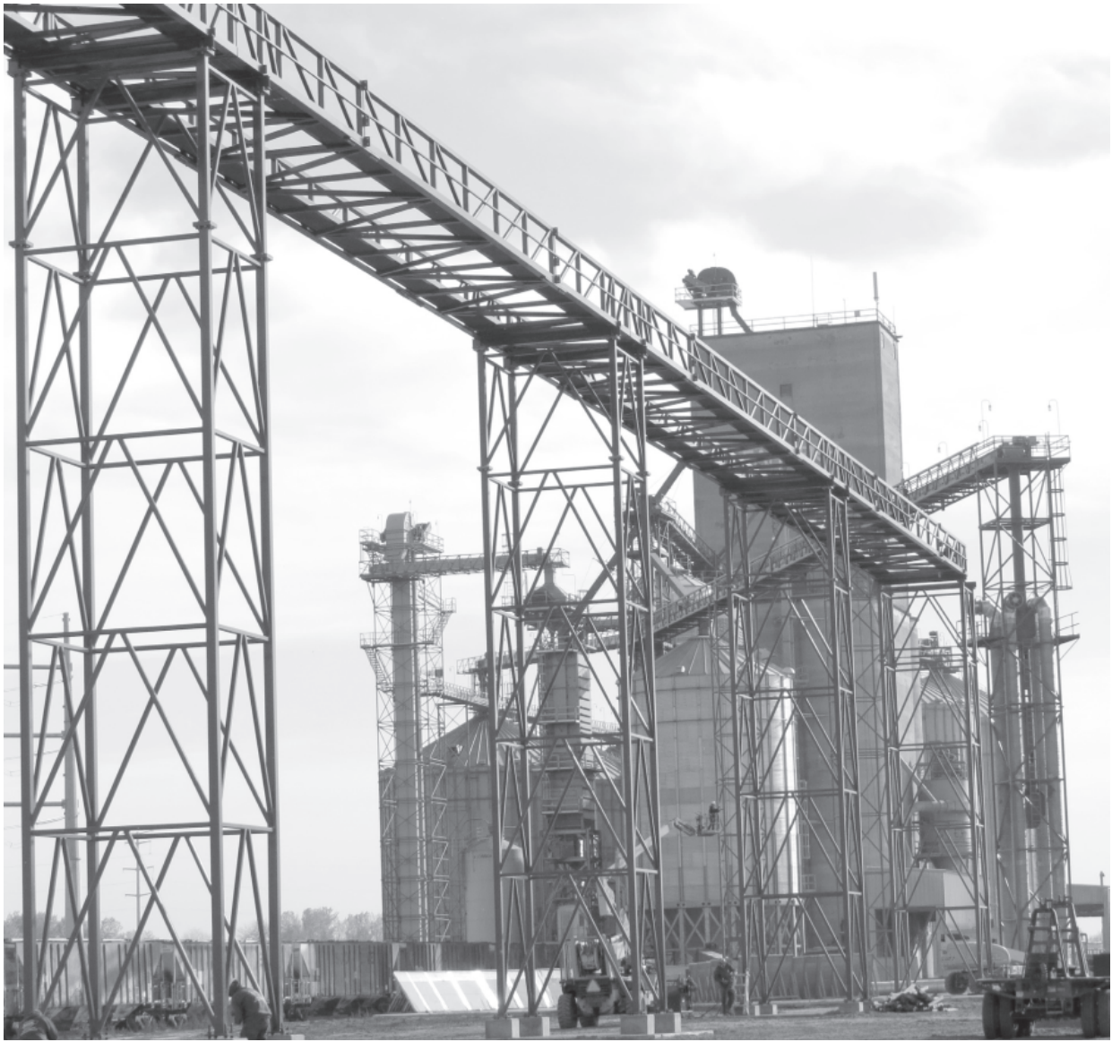
As the steel work nears completion, it creates a twisted maze of what will eventually be functional transfer equipment.