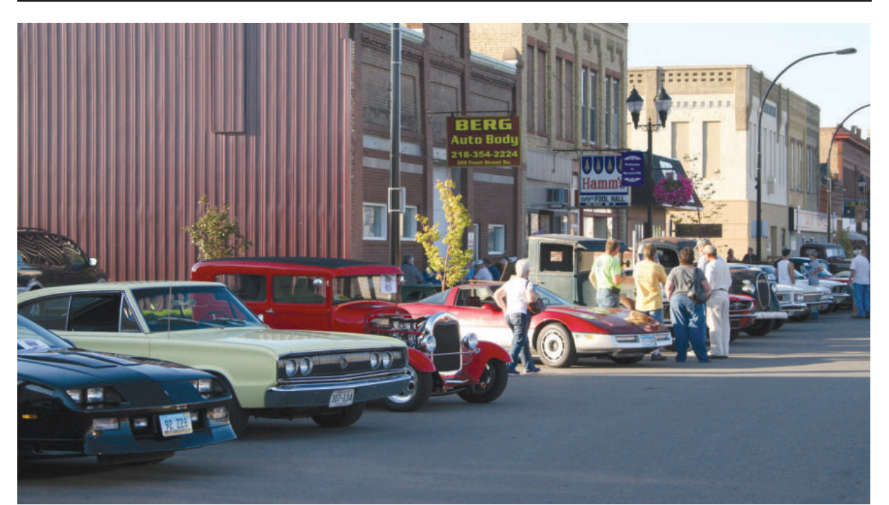
Show 'n' Shine will again be on Front Street this summer.

1. Personal investment, satisfaction and pride that you help Barnesville grow and thrive