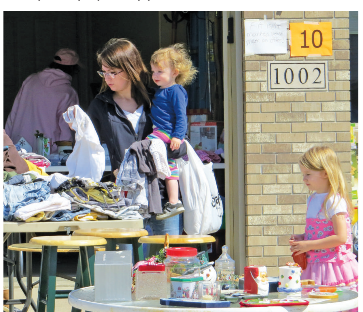
The semi-annual neighborhood rummage sales are planned for May and September.