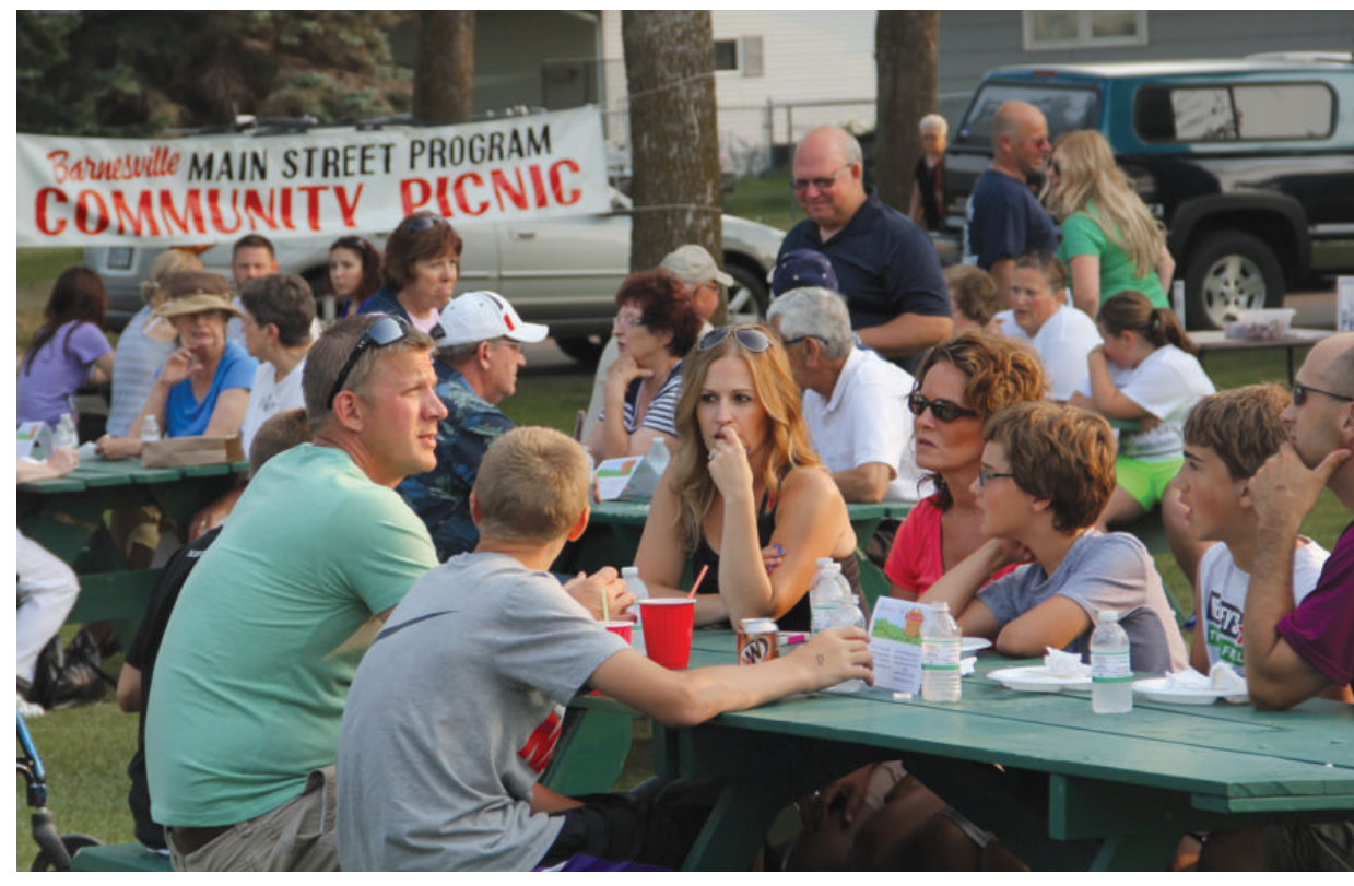
The annual Barnesville Community Picnic is one of the many events under the direction of the Main Street program.

said. "The new Friends of Main but equally important. We're asking Picnic in July. Below are 10 reasons