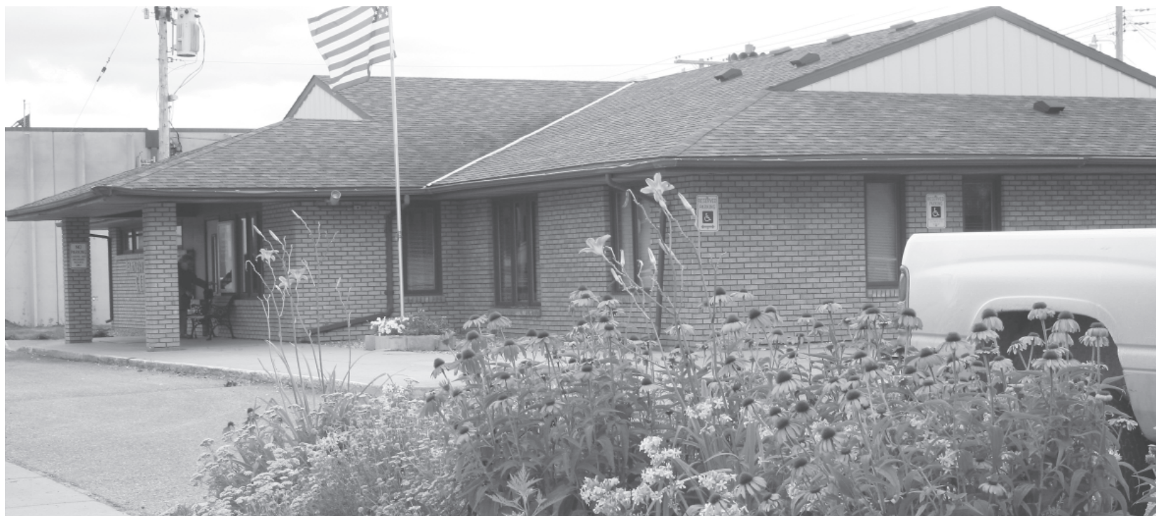
The Barnesville area clinic has been a part of the Barnesville health community for nearly 40 years.